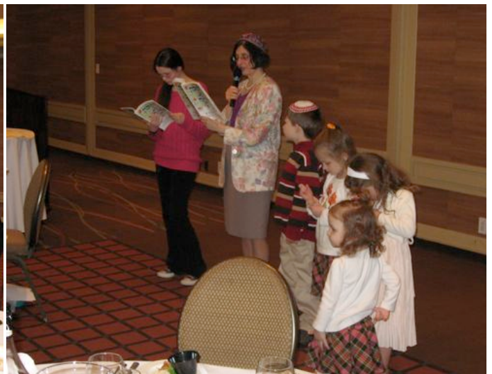
CBA Congregational Seder 2013