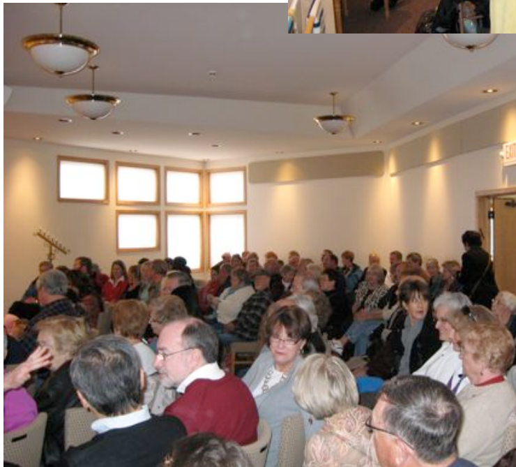
Rescue in the Philippines at CBA