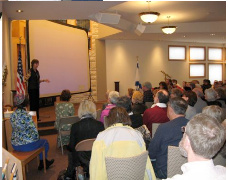
Rescue in the Philippines at CBA