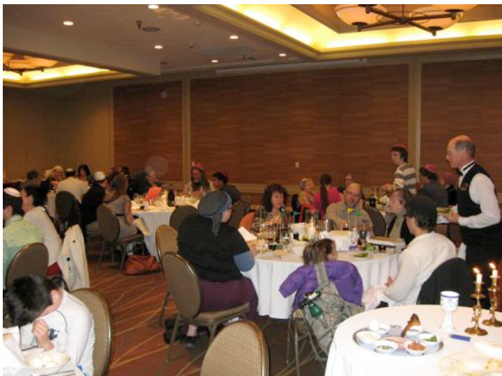
CBA Congregational Seder 2013