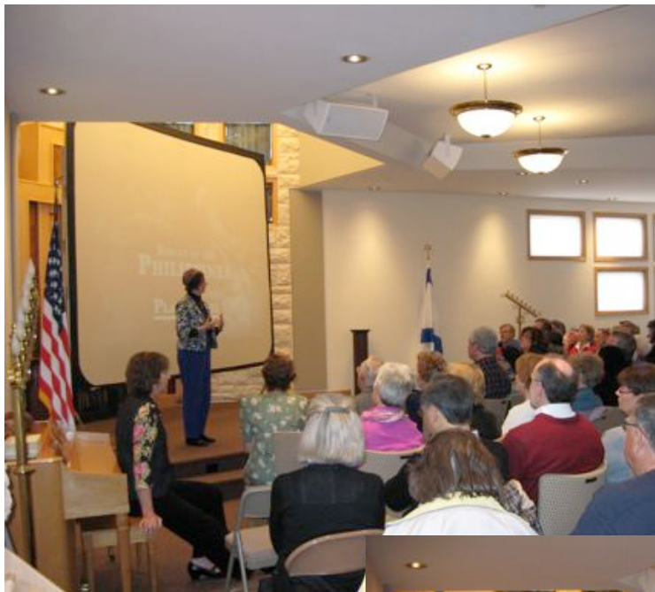
Rescue in the Philippines at CBA